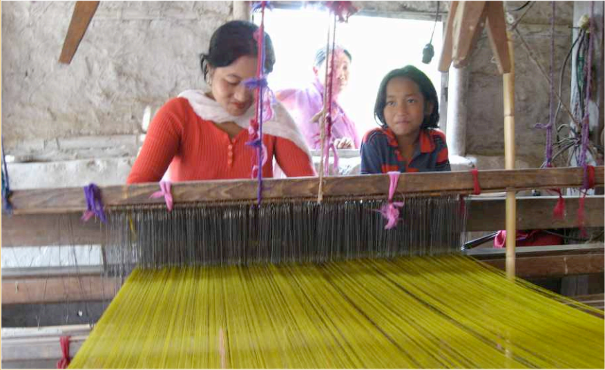
Member of the Panthoibi Self Help Group in Mekola village at work.

Manipur enjoys a distinct place among the handloom zones in India. And like many women from Manipur's different communities and ethnic groups, most of the gun survivors are skilled in making handloom and handicraft items.